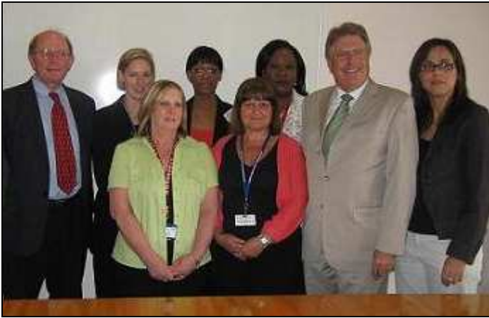
Mr Evennett with staff at the Queen Elizabeth Hospital

In June the APPG organised another visit for an MP to his local TB service. David Evennett MP met with staff of Queen Elizabeth Hospital in Greenwich to discover how his constituents are affected by TB.